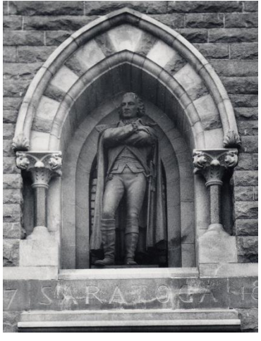
Philip Schuyler niche on the Saratoga Monument

IV. Signposts – informing and bringing in travelers from nearby places, highways and byways