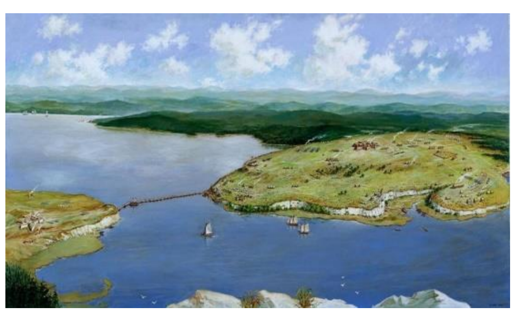
Painting by Ernest Hass. Used by permission of the Mount Independence Coalition All rights reserved.

Future issues of the Friends newsletter will feature articles about the other forms of commemoration relating to the Battles of Saratoga.