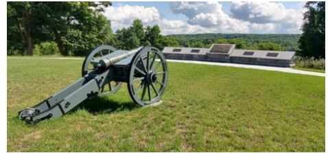
Saratoga Surrender Site August 2020