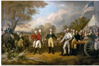
Gen. Burgoyne October 17, 1777